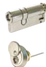
eMAKS Euro & yale lock

No wiring or batteries are needed so locks are completely portable. Normal locks can be replaced by eMAKS locks and key systems.