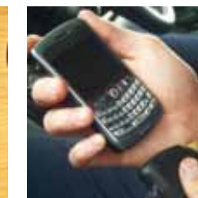
eMAKS Mobile devices