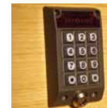
eMAKS keypad port