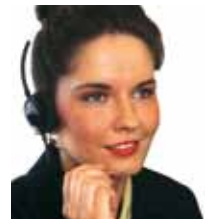
eMAKS 24/7 Response Centre