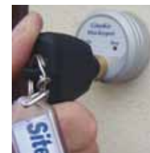
eMAKS mini port lock