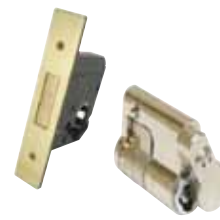
eMAKS mortice lock